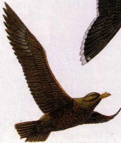
GIANT PETREL ( Macronectes giganteus )