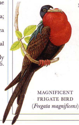
MAGNIFICENT FRIGATE BIRD ( Fregata magnificens )