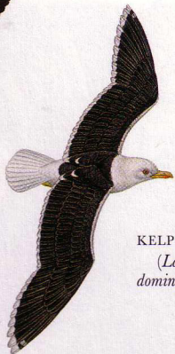
KELP GULL ( Larus dominicanus )