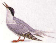
ARCTIC TERN ( Sterna paradisaea )